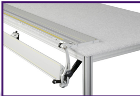
Flip over the cutter bar for full unobstructed bench surface